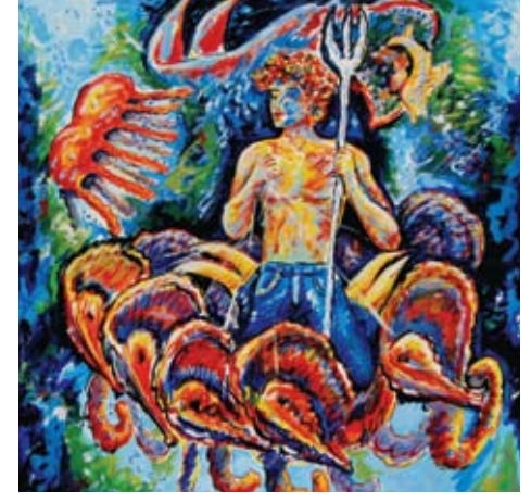
'POSEIDON IN JEANS' OIL ON CANVAS 40' x 40"