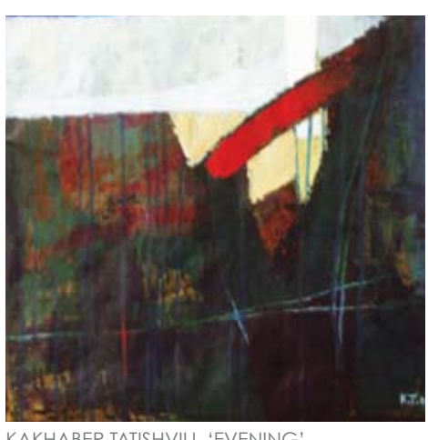
KAKHABER TATISHVILI 'EVENING' OIL ON PAPER 19" x 18"