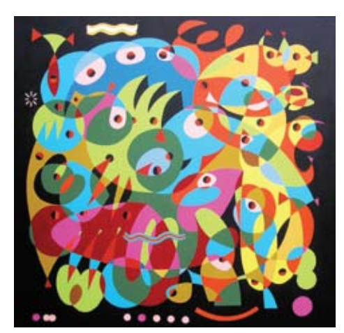
PETER McCANN 'ABSTRACT O6O709' ACRYLIC ON CANVAS 40" x 40"