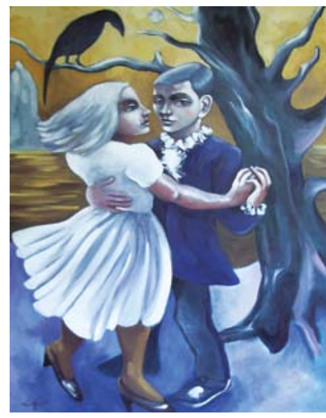
FRASER CRAWFORD 'THE WATCHER' OIL ON CANVAS 30" x 40"