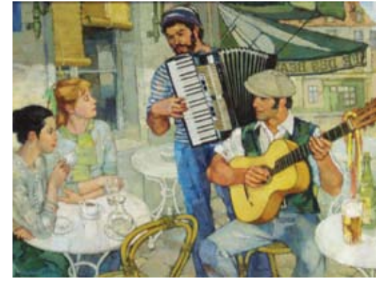
CHARLES BANNERMAN 'CAFE SERENADE' OIL ON BOARD 22" x 16"