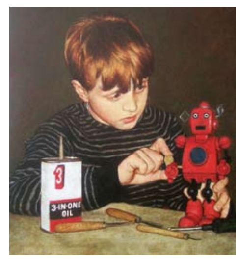
JOHN AFFLICK 'GOD CREATED ADAM II' OIL ON CANVAS 20" x 16"