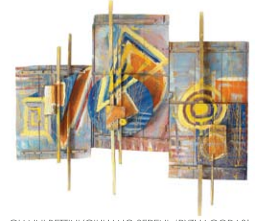
GIANNI BETTINI/GIULIANO SERENI 'PYTHAGORAS' MIXED MEDIA 59" x 51" WALL SCULPTURE