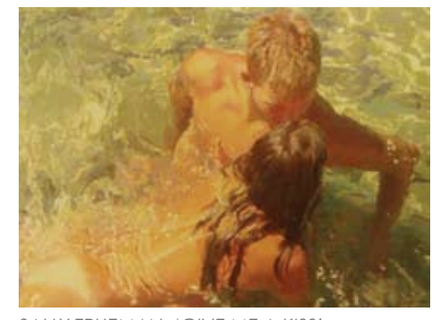
SALLY TRUEMAN 'GIVE ME A KISS' PASTEL 20" x 15"