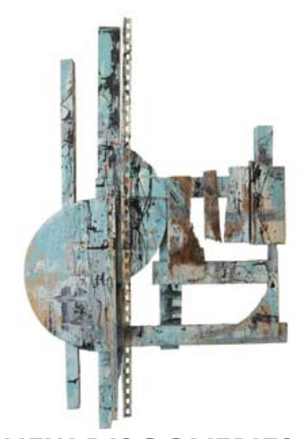
NEW DISCOVERIES INTRODUCING EXCITING NEW TALENT TO GALLERY KALEIDOSCOPE