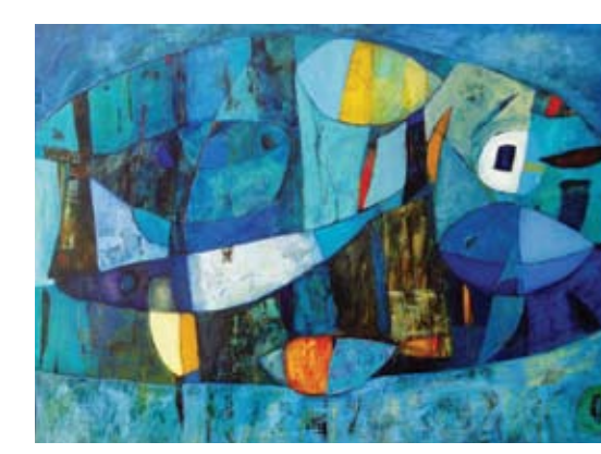
GOSIA KRYK 'BLUE BLUE ABSTRACT' OIL ON CANVAS 51" X 37"