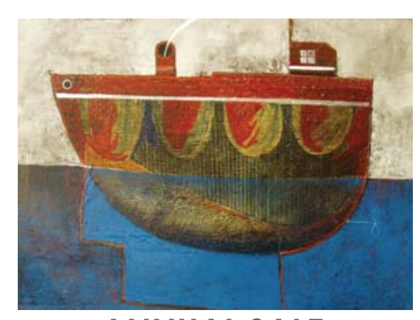
ANNUAL SALE HUNDREDS OF WONDERFUL BARGAINS IN PAINTINGS, PRINTS, SCULPTURE AND CERAMICS.