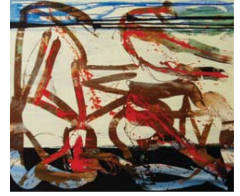
MAURICE COCKRILL 'WHITE SAND' OIL ON CANVAS 47" x 40"