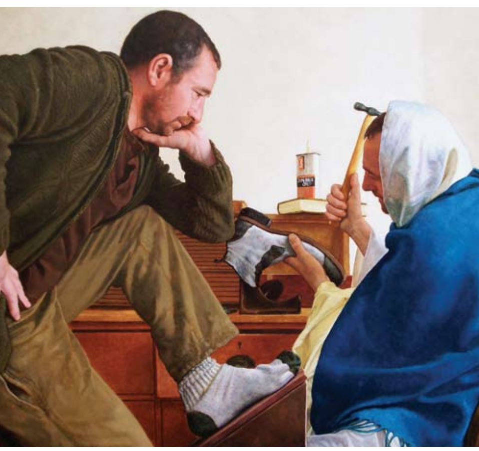
JOHN AFFLICK 'THE MYSTIC COBBLER' OIL ON CANVAS 24" x 19"