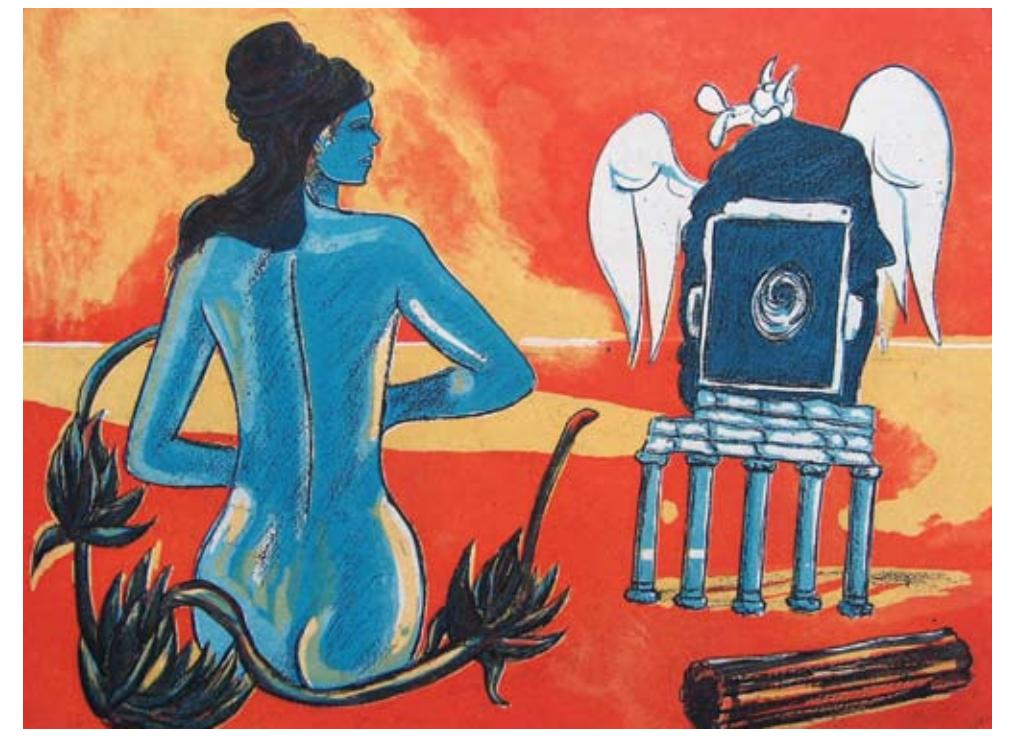
'LA POSA' AQUATINT 20" x 28"