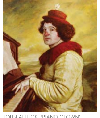
JOHN AFFLICK 'PIANO CLOWN' OIL ON CANVAS 16" x 20"